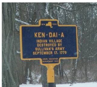
Historical marker at the location of Kendaia, a Native American archaeological site located within the park.

Long before Europeans arrived on the continent, Native Americans were living and traveling by way of footpaths throughout the Finger Lakes and along the shores of Lake Ontario. For more than 10,000 years, prehistoric people made settlements, grew agricultural crops, hunted, and fished in the Finger Lakes region, with the Iroquois Nation the last of a series of Indian cultures to have lived here.