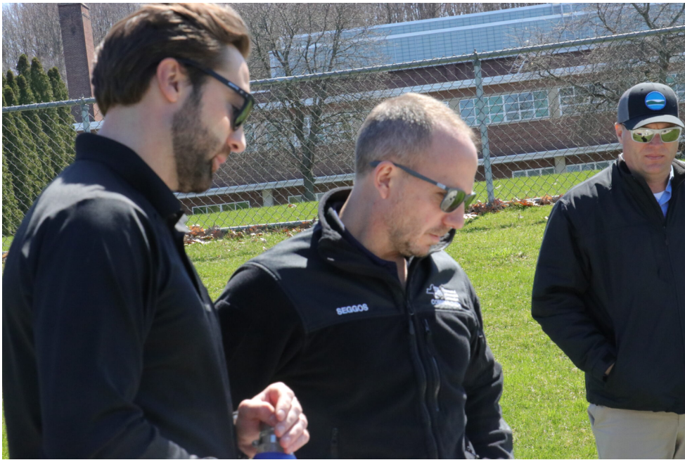
DEC Commissioner Basil Seggos says he nonetheless has considerations over Greenidge Era’s allow software.