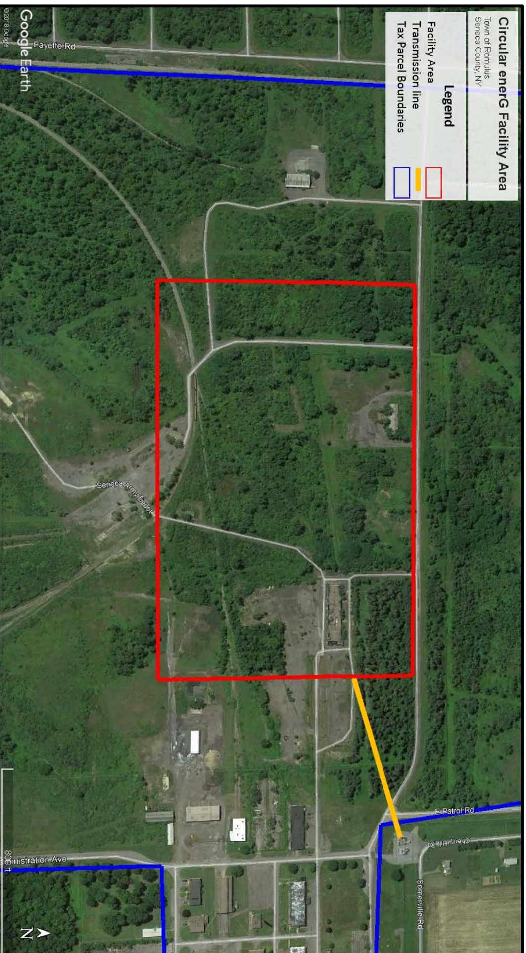
FIGURE A- FACILITY AREA